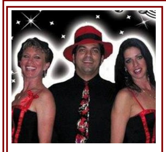
Showtime Entertainment Live in the Canteen 7 - 11 pm July 14th & 21st August 11th & 18th